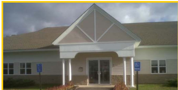
SCEC's new home—in the Machias CareerCenter building

Initiating and facilitating the creation of jobs and prosperity in Washington County