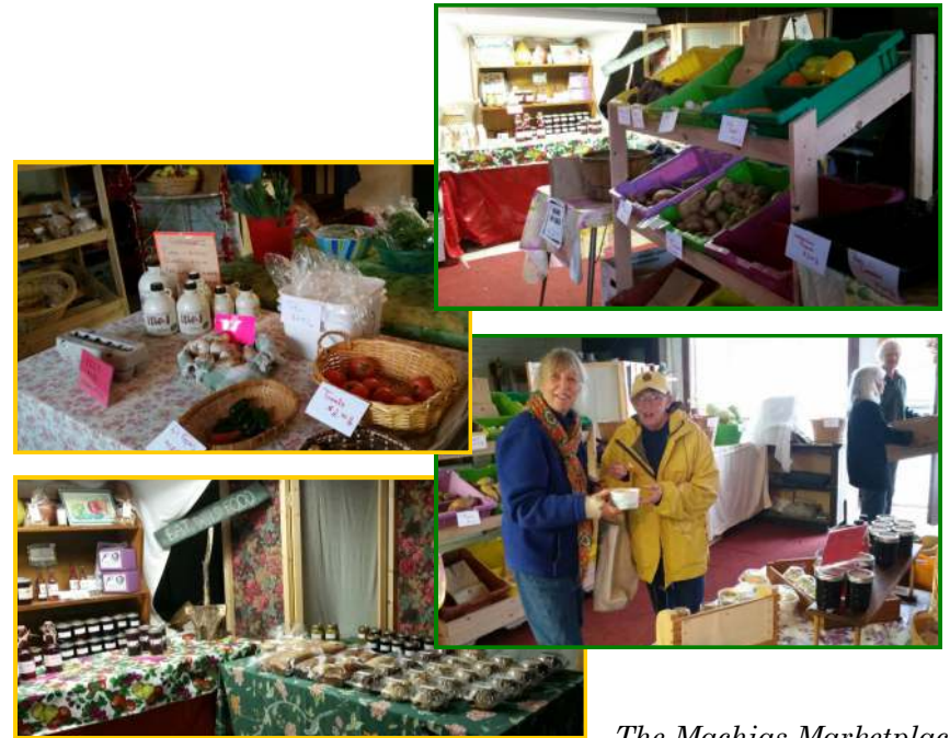
The Machias Marketplace

Initiating and facilitating the creation of jobs and prosperity in Washington County