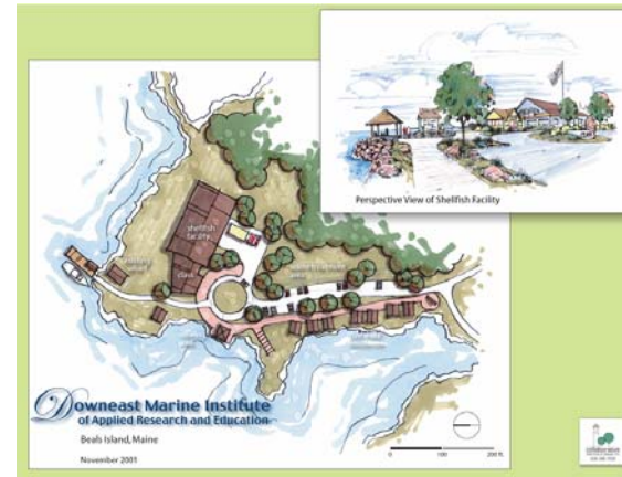
Downeast Marine Institute of Applied Research and Education Beals Island, Maine November 2001