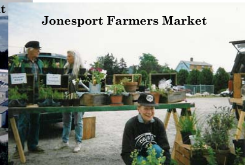
Jonesport Farmers Market