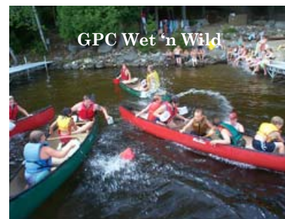
GPC Wet 'n Wild