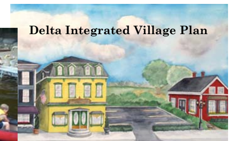
Delta Integrated Village Plan